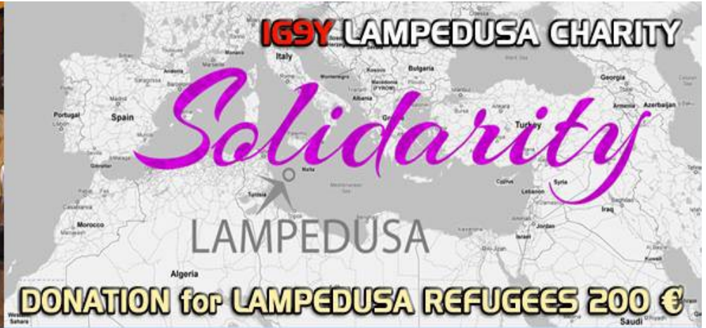
IG9Y TEAM with DONORS